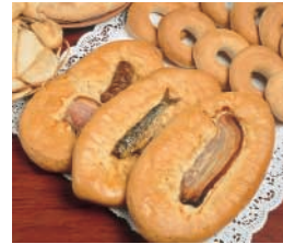
Dried and salted fish preparations are exquisite appetisers. Just like local salads and pizza-like "cocas", with bread-like bases topped with anchovies, sausages or dried fish and tomato.

Similar preserving is carried out on local meats as well. Pork sausages include black botifarres (blood sausage), llonganissa (pork sausage), long, thin Easter sausage called llonganissa de Pascua , white sausages called blanquets , red-hot chorizos , and the typical sobrasada (red sausage spread) from the Marina district. All these can be eaten either as is, or fried, or as ingredients in rice dishes and stews. Many of them are unique to a particular area, of Moorish influence, using herbs from the local mountains, plus cinnamon, nutmeg, dried fruits and nuts, and aniseeds.