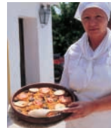
In Valencia rice is a symbol of regional identity, an emblematic dish.