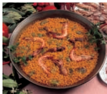
Rices are cooked in pots, earthenware casseroles, steel casseroles and the famous metal paella pans.

Although there are as many kinds of paellas as there are districts in the region, genuine Valencian paella most always has a good helping of ferraduras (long, wide-pod green beans) and garrofó (giant dried butter beans). As for meats, chicken is the most common, followed by rabbit, and exceptionally wild duck. Adding extra flavour are white-shelled mountain snails known as xonetes or vaquetes with thin black stripes, providing what some call an exquisite taste, and often fetching very high prices. But there are also seafood and shellfish paellas, which in recent years have become increasingly popular, particularly the high-priced but mouth-watering lobster paella.