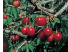
Valencian cuisine mixes mountain and sea. Shown above is a fishing port where fresh fish and shellfish arrive daily thanks to thriving fleets, and fine fruits and vegetables from orchards and market gardens.

And the above list does not include industrial products such as the nougat-like turrón from Xixona and the fine-tasting chocolate from La Vila Joiosa - products that are highly important in the lineup of Valencian and Spanish products, especially at Christmas time. Also of note is the small game hunted in forests and scrubland, ducks from lagoons and marshlands, the more homely free-range chicken, and locally harvested snails from the garden and mountain, all of which are essential in many dishes that are typical of this region.