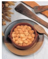
In the interior, stews and boiled dishes are popular (ollas, olletes, putxeros and tarongetes), using vegetables, legumes and pork as their main ingredients.