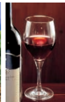
Valencia wines have evolved spectacularly, thanks to advance technology and age-old traditional knowledge, very fine whites, reds and rosés are obtained.

Another quality Alicante wine is called Fondillón, a typical old maderised white wine with a high alcohol content, rich and red in its early stages but turning amber following barrel maturation, made from grapes drenched by the sun and held up on cane supports, some of which are also ideal as dessert grapes. In Utiel-Requena, where the red bobal grape thrives in the company of tempranillo and other "improvers" ( cabernet-sauvignon and merlot ), increasingly attractive reds and rosés are being obtained. The rosés are balanced and fresh, with an agreeable flavour, and the reds have medium full bodies, savoury and elegant with all the characteristics of the finest Spanish wines.