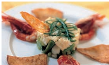
Legumes and vegetables, such as artichokes from Benicarló, come in outstanding qualities. They form the basis of many traditional and modern dishes.