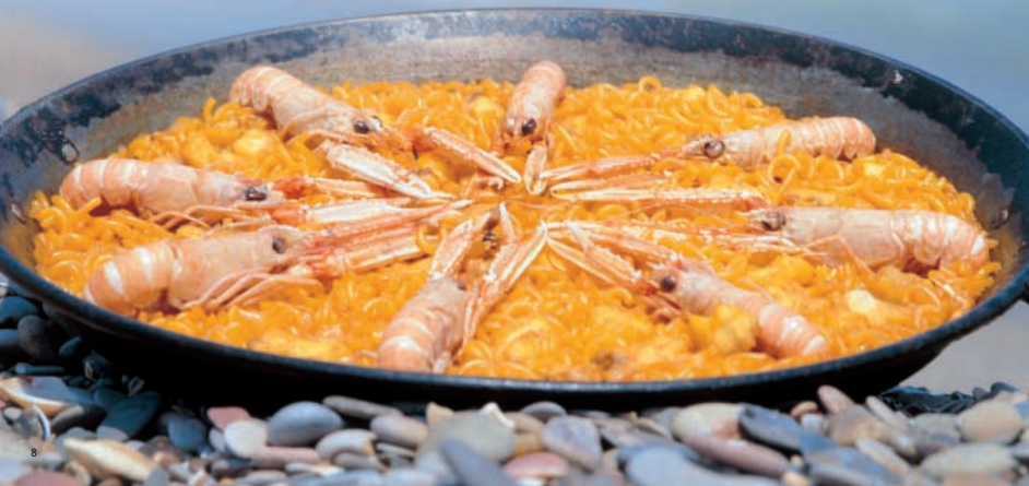
A typical "fideuà" from Gandia, which is similar to a seafood paella, but made with noodles instead of rice.

Because of its very nature, the paella is exaggeratedly Baroque. It is a festive, popular and, curiously enough, a masculine meal customarily made by men out-of-doors. The Valencian phrase anar de paella (to go paella-eating), customarily used throughout the region, provides a glimpse of the ritual nature of this pursuit, which may involve outings, hunting parties, picnics and the like. Making a paella is less simple than it looks, and there are self-named specialists in every single village, town and district. The actual style is greatly dependent on environmental factors, such as the availability of raw materials, the type of rice grain ( bomba , granza , secreti ), the composition of the local water, the proportion of oil actually used, not to mention the kind of wood used to kindle the paella fire - another art in itself.