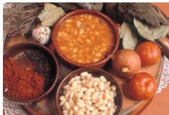
A bean and partridge stew, or perhaps a duck stew, serve as a good introduction to Valencia's gastronomic delights from the pot.

finely shredded, which is thickened using dried, unleavened bread called tortas . It is something like a rustic version of a meat lasagna.