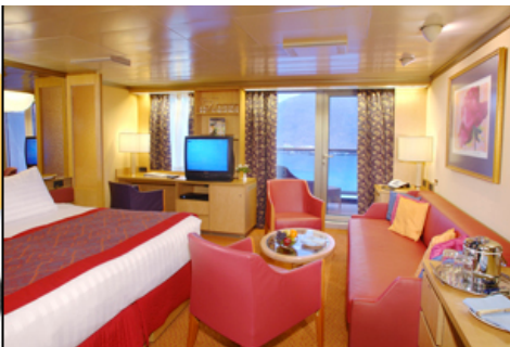
Superior Suite: $1,999