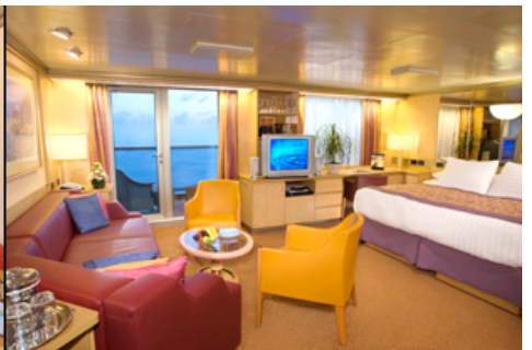
Full Suite: $3,799