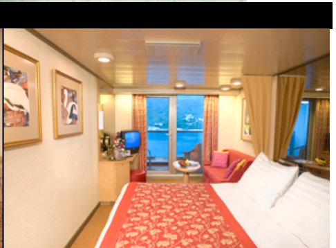
Verandah: $1,599 – $1,849