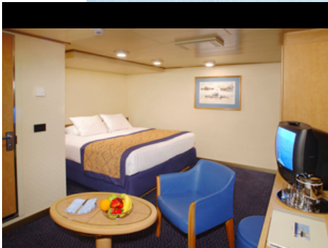
Better Inside: $999 – $1,099