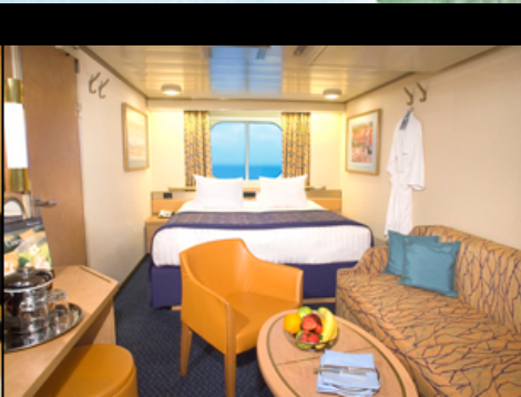
Better Outside: $1,199 – $1,299