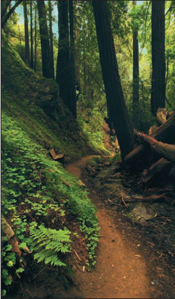
Hiking trail in Julia Pfeiffer Burns State Park

ANDREW MOLERA STATE PARK — Located 23 miles south of Carmel, Andrew Molera State Park is the largest State Park on the Big Sur Coast. A wide, scenic, mile-long path leads to a sandy beach that is sheltered from the wind by a large bluff to