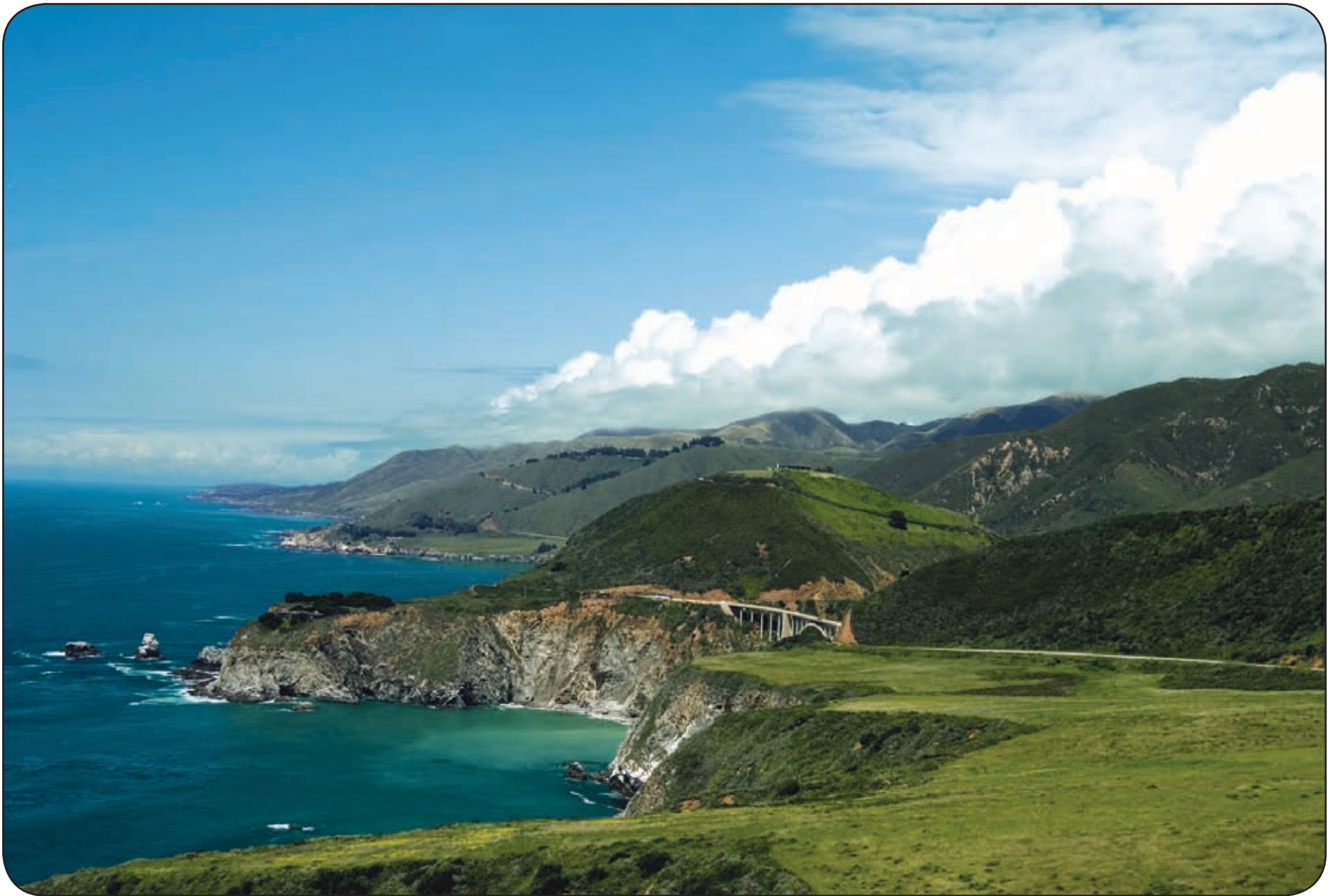
Big Sur Coastline and Bixby Bridge