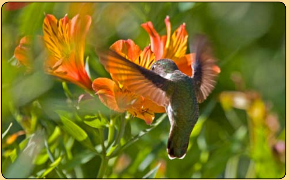
Hummingbird in Big Sur