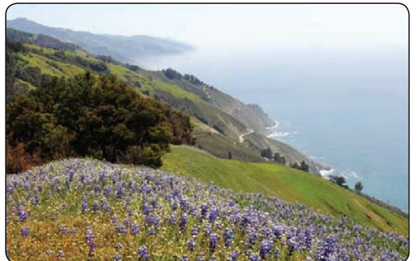
Boronda Trail photo; Stan Russell