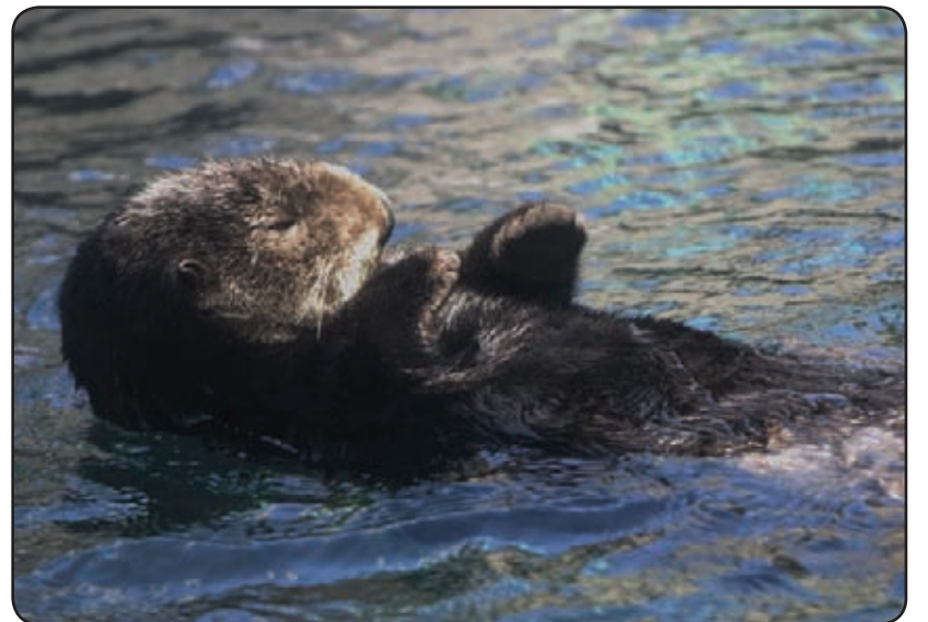
California Sea Otter