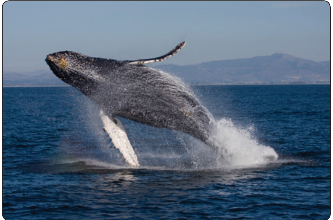
Humpback whales breaching in Monterey Bay National Marine Sanctuary