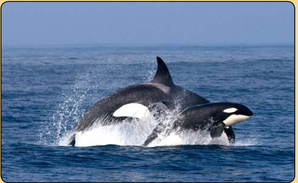
Orca in the Monterey Bay National Marine Sanctuary