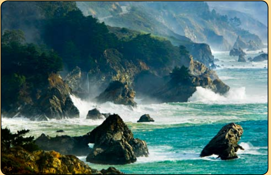
Julia Pfeiffer Burns State Park and the Big Sur Coast