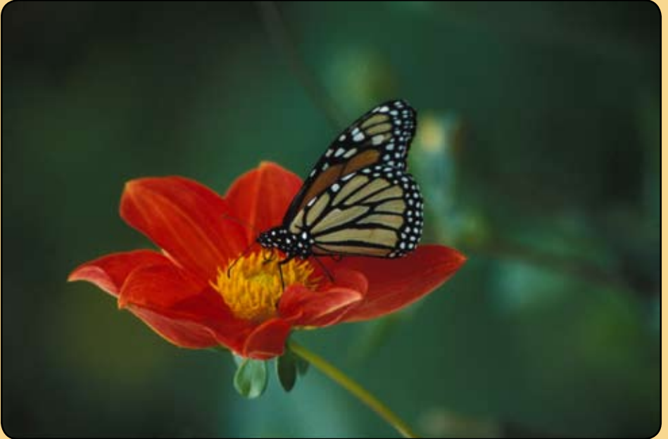
Monarch Butterfly winter migration to Big Sur