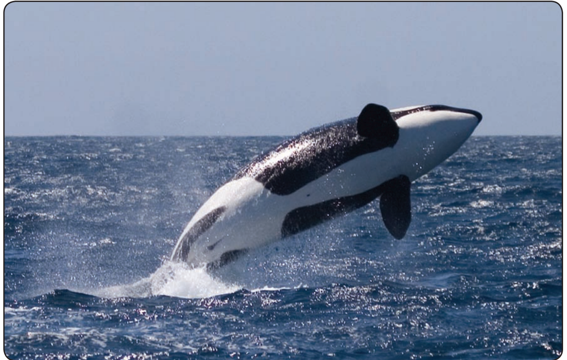
Orca breaching in Monterey Bay National Marine Sanctuary

The Route 22 bus runs daily from Monterey to Big Sur April - October www.mst.org 1-888-MST-BUS1 (1-888-678-2871)