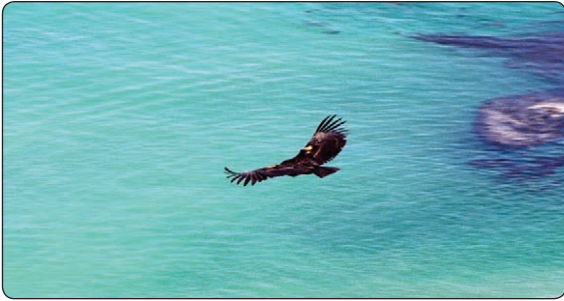
California Condor in Flight