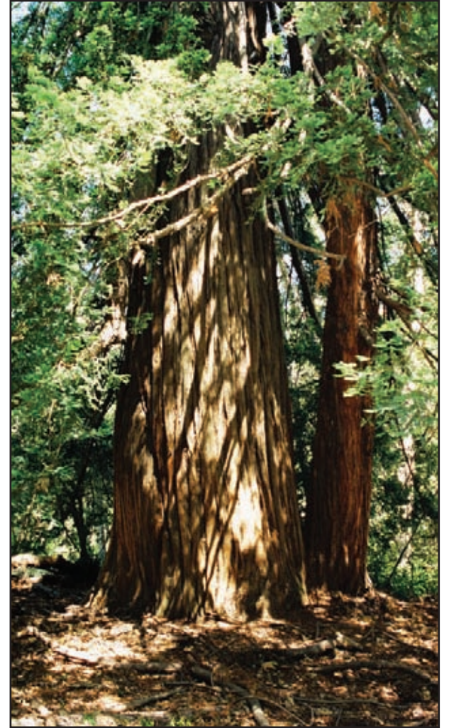
1,100 year old Colonial Tree in Pfeiffer Big Sur State State Park