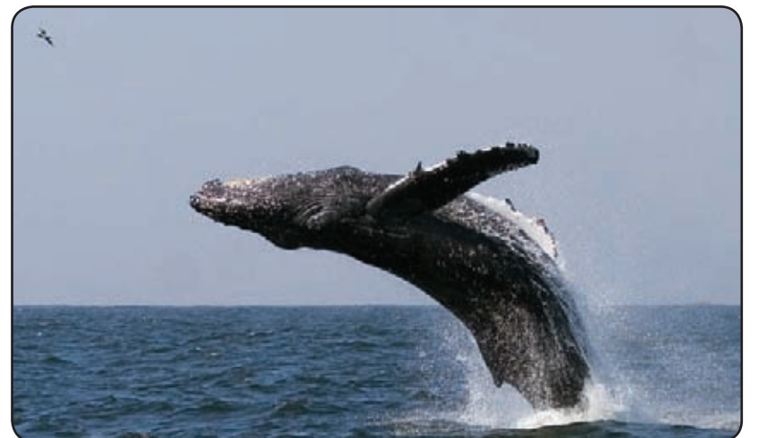
Breaching Humpback Whale photo; Daniel Bianchetta