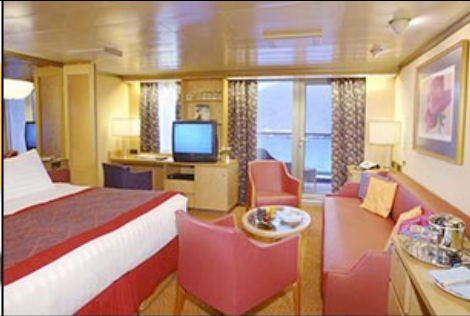
Superior Suite - $2,999