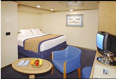
Inside Staterooms: $1,529 - $1,649