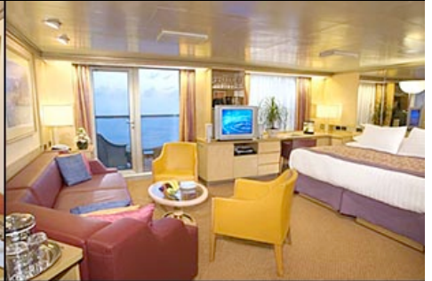
Full Suite - $5,199