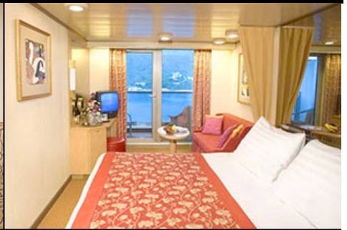
Outside with Balcony: $2,239 - $2,399