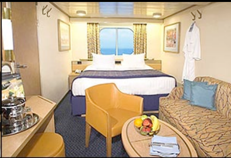
Outside Staterooms: $1,759 - $1,909