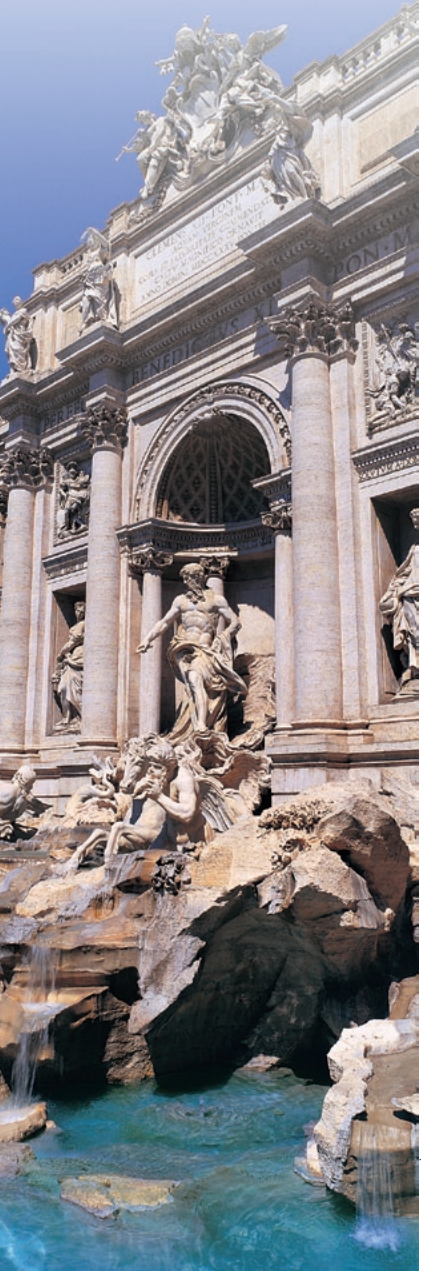
Fountain in Spain

Best of all, he'll show you how to use iPhoto and Photoshop as springboards to do more with your photos: edit and crop them for the greatest impact, create Web-page galleries of them, build musical slide shows on DVD for unforgettable gifts, and much more.