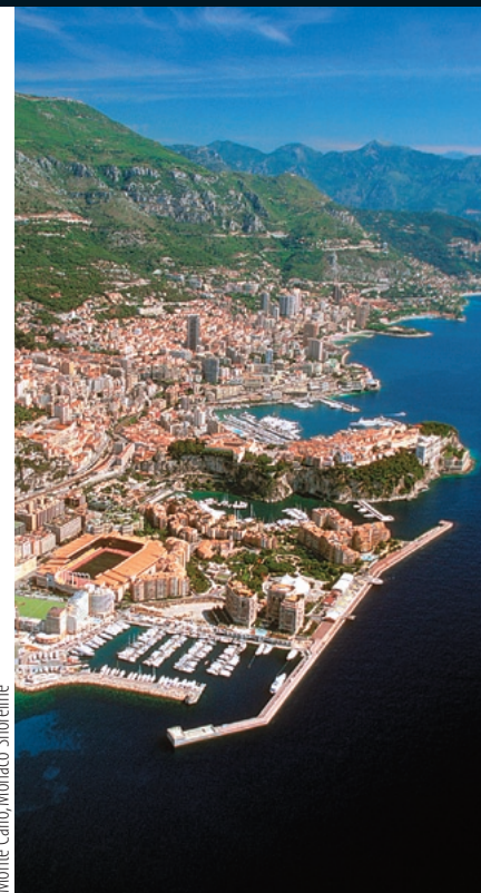
Monte Carlo, Monaco Shoreline