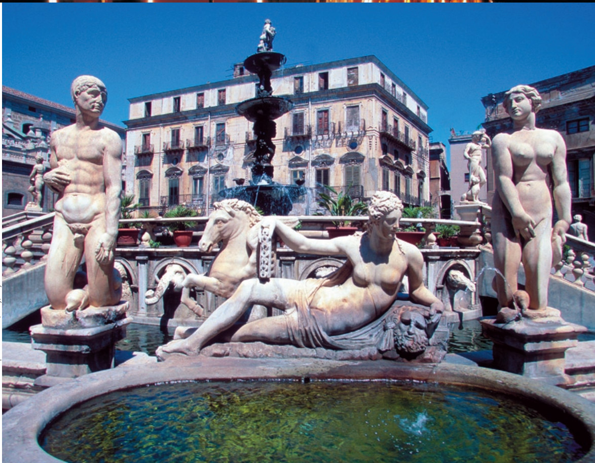
Palermo Pretoria Square Fountain, Sicily, Italy

Book now at GeekCruises.com or call us at 650.327.3692