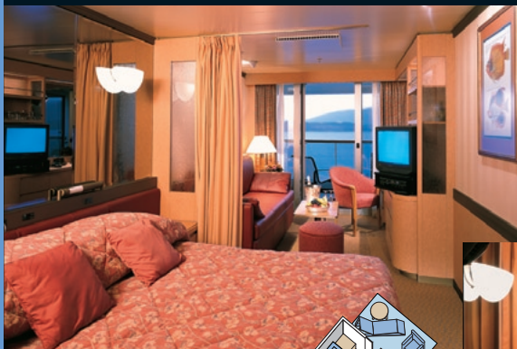
Mini-Suites on the ms Noordam are big on luxury: private verandahs, whirlpool baths, VCRs, and mini bars.

http://www.GeekCruises.com/booking/mm045_booking.htm