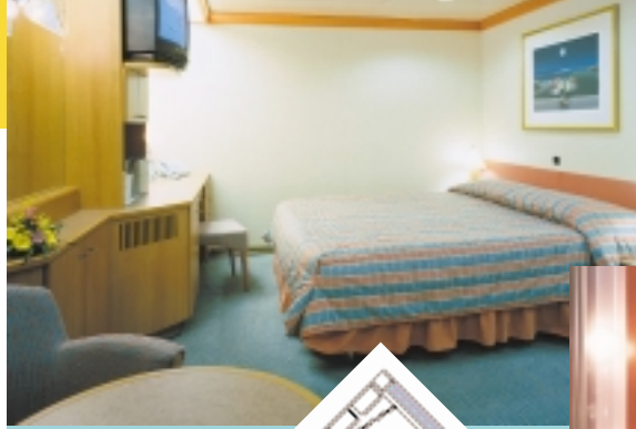
Inside Cabin on the mvCosta Mediterranea

http://geekcruises.com/booking/ll4_booking.html