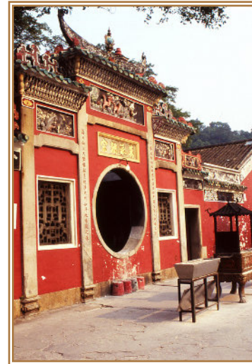
A-Ma Temple, Macau

B, L, D denote Breakfast, Lunch and Dinner