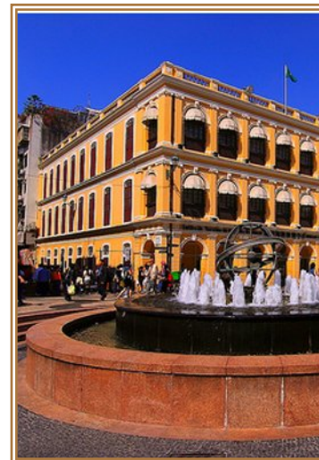
Senado Square, Macau