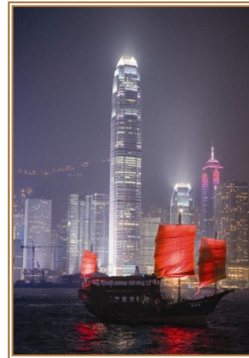
International Finance Centre