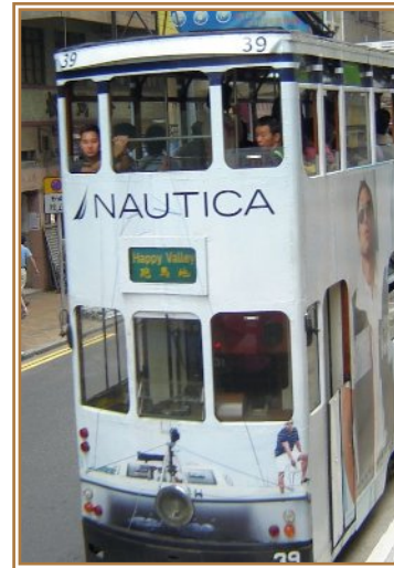
Hong Kong Tram

Late afternoon you will be returned to the dock for an evening cocktail and departure.