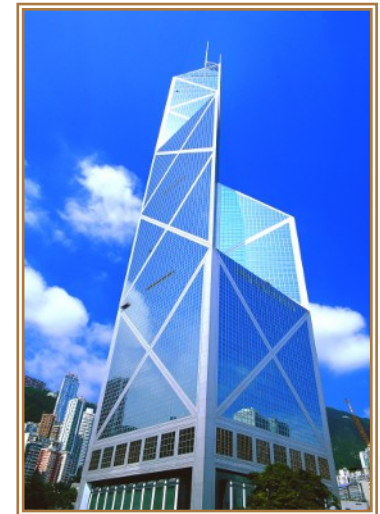
Bank of China Building