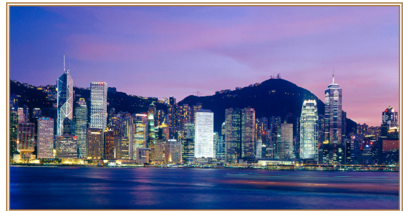
Hong Kong Skyline