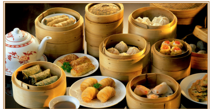
Cantonese Dim Sum