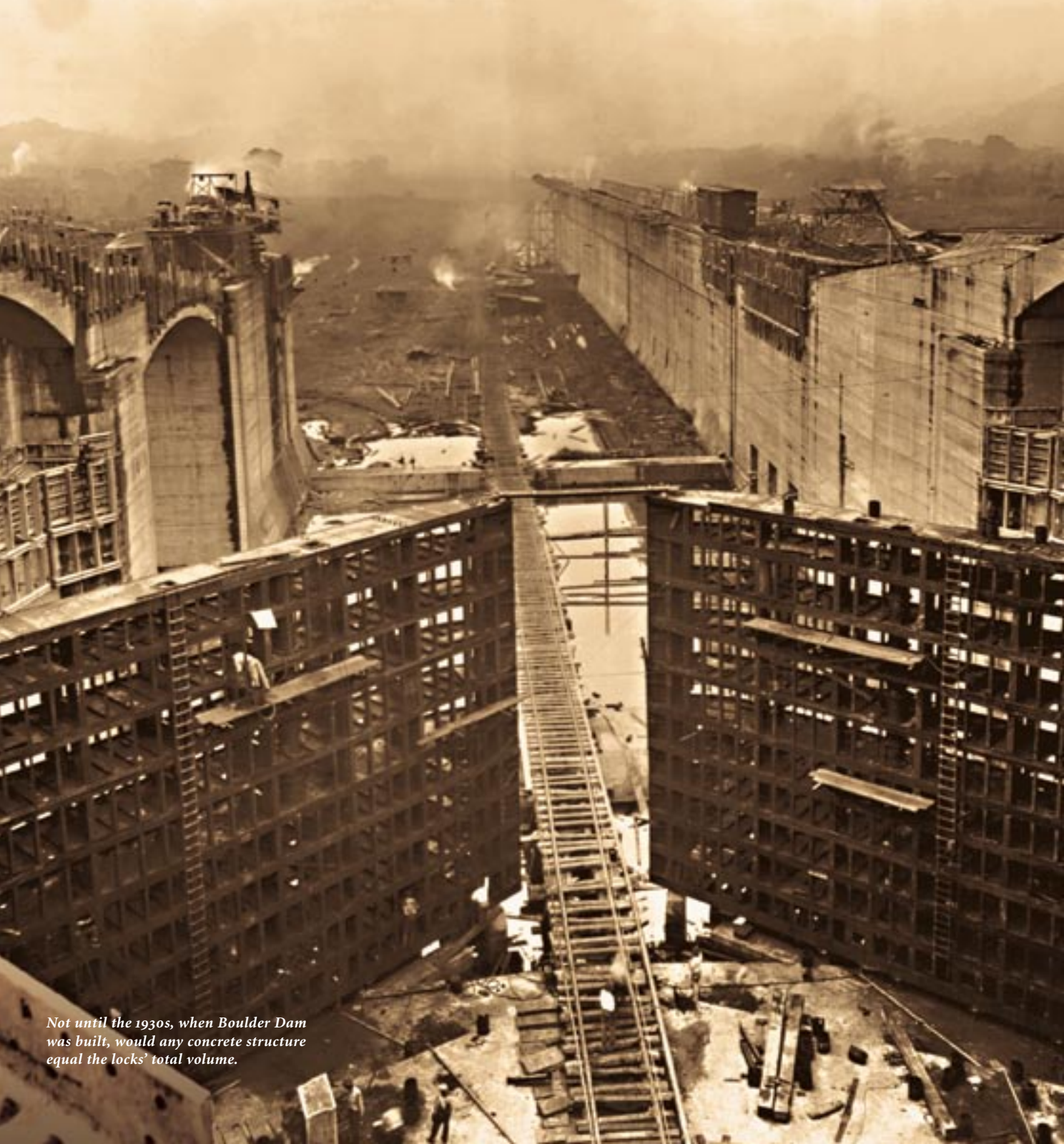
Not until the 1930s, when Boulder Dam was built, would any concrete structure equal the locks' total volume.

The Panama Canal was a romantic tourist destination even before its opening. Reporters, photojournalists, adventurers and the curious came from around the world. What they found was almost too big for words. One early reporter wired, "This canal is both a first and a last... man will never again build with such scope, such imagination."