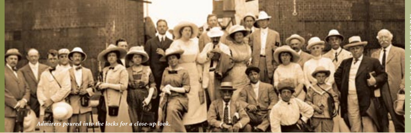
Admirers poured into the locks for a close-up look.