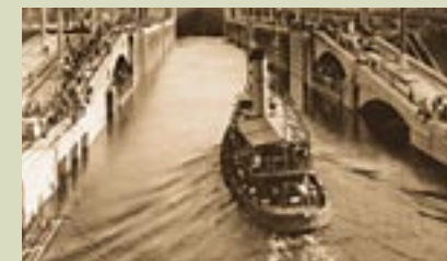
Theodore Roosevelt believed a canal was indispensable to U.S. supremacy at sea, which was secured by the trial lockage in 1913.

A COLOSSAL UNDERTAKING "Everything is on a colossal scale," marveled a journalist for Scientific American . Locks with walls 1,000 feet long! Gates seven feet thick! And most amazing: Everything still works perfectly after nearly 100 years of constant operation.