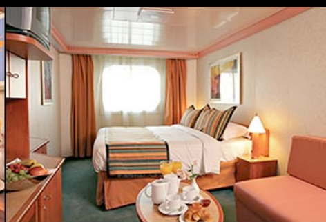
Outside Stateroom - $1,399