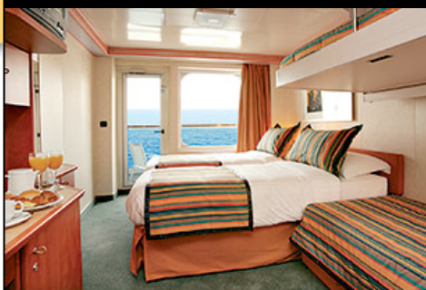
Outside w/ Balcony - $1,599 to $1,699