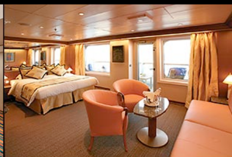
Suites - $2,199 to $2,899 (Grand shown)