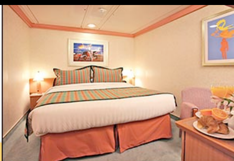
Inside Stateroom - $999 to $1,199