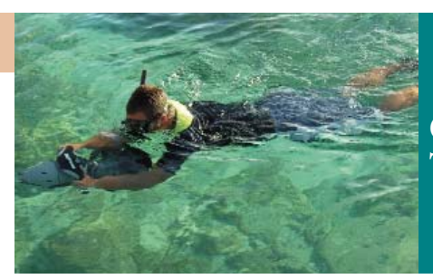
Grand Turk, Turks & Caicos

After a short bus transfer, you will board the Nautilus semi-sub for an exciting undersea tour, gliding gracefully through Cayman's tropical waters, but never completely submerged in a spacious, air-conditioned underwater observatory. A marine expert tells you the history of the ghostly Cali and Balboa shipwrecks. At Cheeseburger Reef a diver hand-feeds the fish at your window.